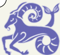
CAPRICORN (Goat) December 22 - January 19

A Full Moon in Cancer on January 3 brings some tension or attention to your close relationships. Some might navigate disagreements with lovers, friends, or family and others might need to address issues they've avoided and set boundaries. Any tension will either help you create a more solid foundation for your future or invite you to break away from relationships that are keeping you stuck. Changes in contracts and client work can also pop up—maybe there's a new opportunity knocking at your door or in your inbox!